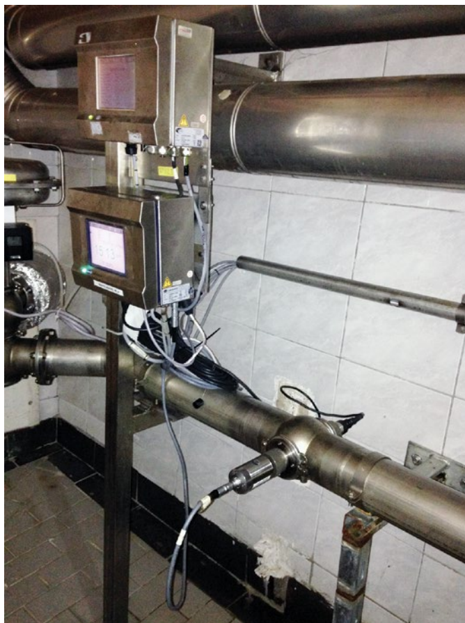
Fig 2. Hach 410 Controllers – typical installation