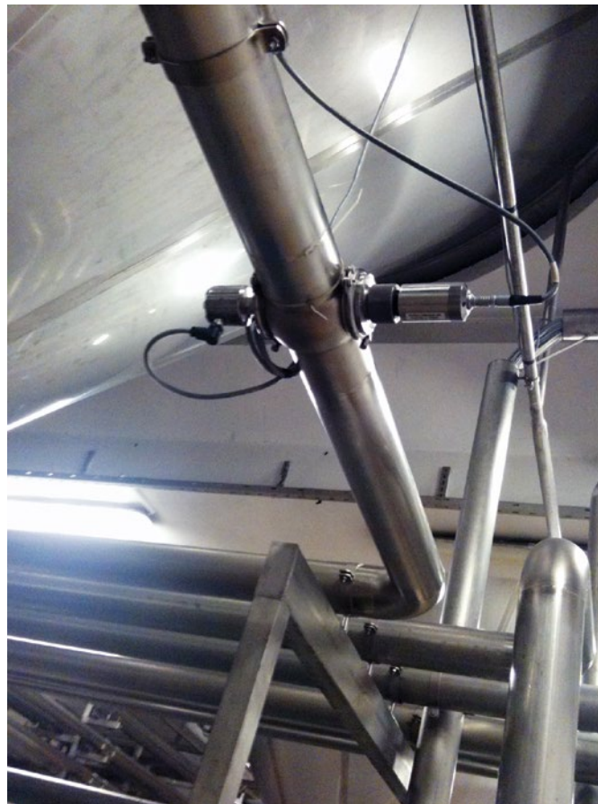
Fig 3. Hach M1100-H LDO sensor – typical installation