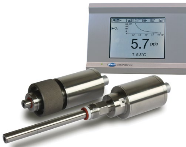
Fig 5. High-range LDO sensor ideal for fermentation management