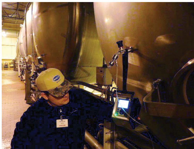
Fig 4. Portable Orbisphere 3100 used for online verification

In contrast, the sensor spot in the low-range LDO sensors is changed and calibrated once per year, and they plan to do the same with the high-range, except at a 6 month interval. The annual plant shut down for maintenance is normally during the period of lowest demand in January, so this is the ideal time to change and recalibrate LDO sensors.