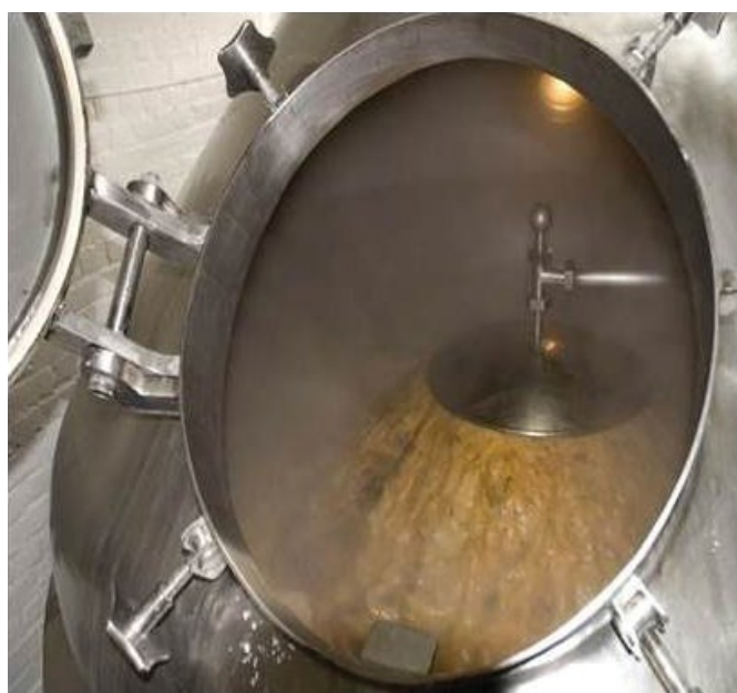
Fig 1. Wort Fermentation

Pure oxygen or air is injected into the wort lines to aid fermentation. This is not to encourage yeast respiration; after pitching, yeast absorbs oxygen rapidly and uses it in membrane biosynthesis. The oxygen enables the yeast cells to grow much faster and to reach a higher cell density. However by controlling the DO levels, at 20ppm for a lager for example, the speed of fermentation proceeds at the correct rate; if fermentation takes too long, production is delayed and if it is too short, the flavour would be affected.