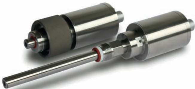
Orbisphere M1100 Optical Dissolved Oxygen Sensor