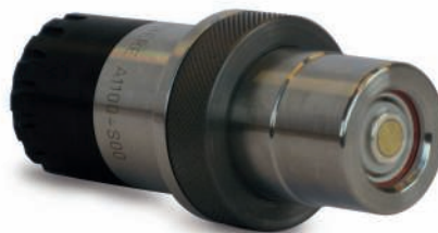
Orbisphere A1100 Amperometric Dissolved Oxygen Sensor